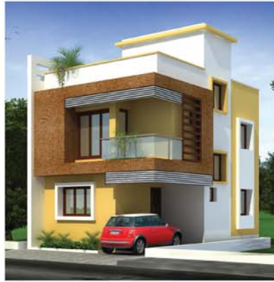
Gayathri Villas, Siruseri