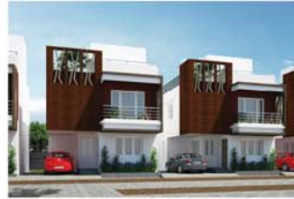
Darshan Kalpavriksham - Chennai