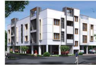
Darshan Borisam Court - Chennai