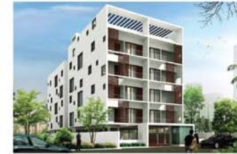
Darshan Brindaavanam - Trichy